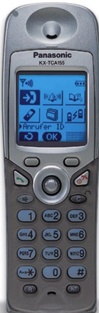
KX-TCA155AL Basic Model

* The KX-TCA155AL and KX-TCA255AL must be connected to a Panasonic KX-TDA Hybrid IP-PBX System.