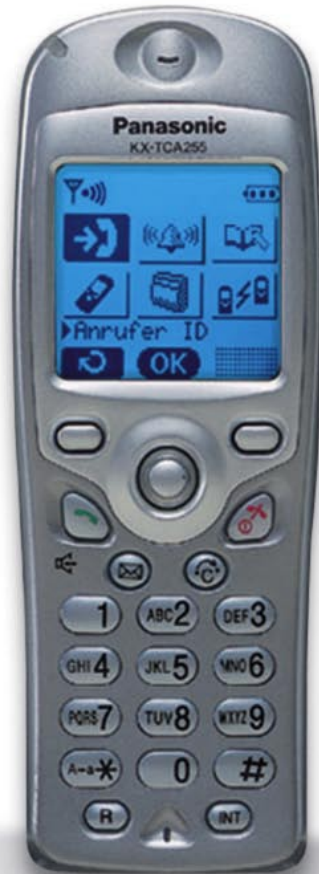
KX-TCA255AL Compact Business Model